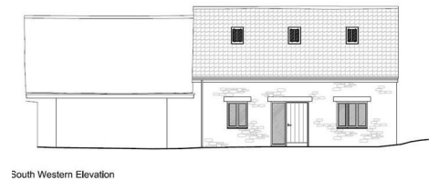
South Western Elevation